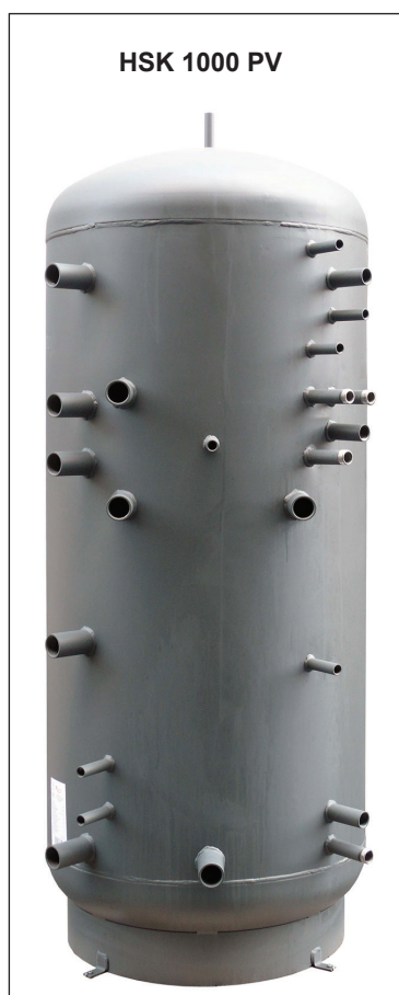
HSK 1000 PV with insulation